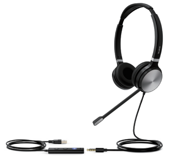
UH36 Dual Teams UH36 Dual UC