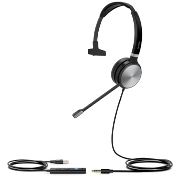
UH36 Mono Teams UH36 Mono UC

Deeply integrated with Yealink IP phones that the advanced features, such as volume synchronization and multiple calls control, are just right at your fingertips.