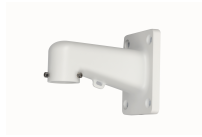
DH-PFB305W Wall mount bracket