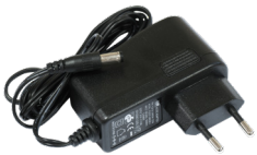
24 V 0.38 A power adapter